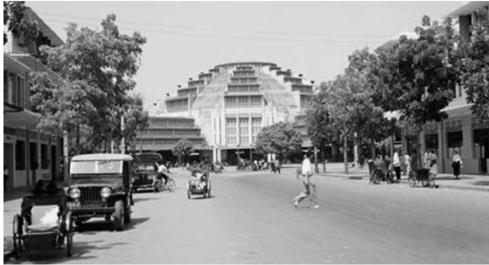
FIGURE 4. Street life in 1950, with Psar Thmei, the city's Art Deco central market, opened in 1937, in the background. The city's celebrated neatness was also one of emptiness.

and create the appearance of coherence in Phnom Penh, even in its absence (FIG. 4).