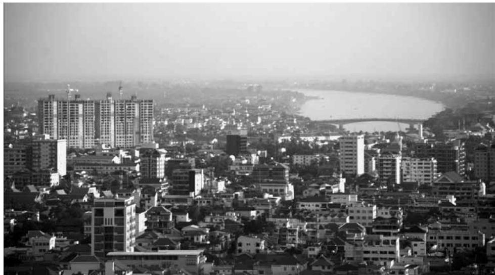
FIGURE 9. The city's upwards expansion.

The imagination and discourse of this new urbanism are made intelligible through specific "Asian" idioms of growth and possibility (FIG. 9). Consistent with this mode of thinking, Phnom Penh has been cast as possessing near-certain potential to repeat the spectacular growth trajectory of such other Asian capitals as Bangkok, Saigon and Seoul. This is not a case of global urban mimicry, where a single template moves from West to the East in teleological form. Rather, the structures and circuits of urban referencing provoke a rethinking of relationships between centers, peripheries and frontiers, as well as the productivities associated with them. It has also been based on massive, multibillion-dollar projects that were conceived at a time when foreign ownership was officially banned (though these rules have relaxed since 2009), and where ownership rules over land continue to be complex and diffuse.