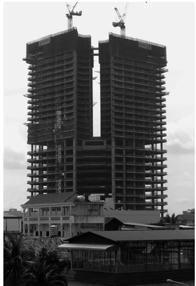
FIGURE 11. Gold Tower 42 in July 2010. The developer, Yon Woo, has called itself the "symbolic global developer" for Phnom Penh. The project is financed by DaeHan Real Estate Investment Trust, whose parent company is the Military Mutual Aid Association, one of the largest pension funds in South Korea.

Projects such as these and the International Finance Complex (IFC) on the southern waterfront of Tonle Bassac,