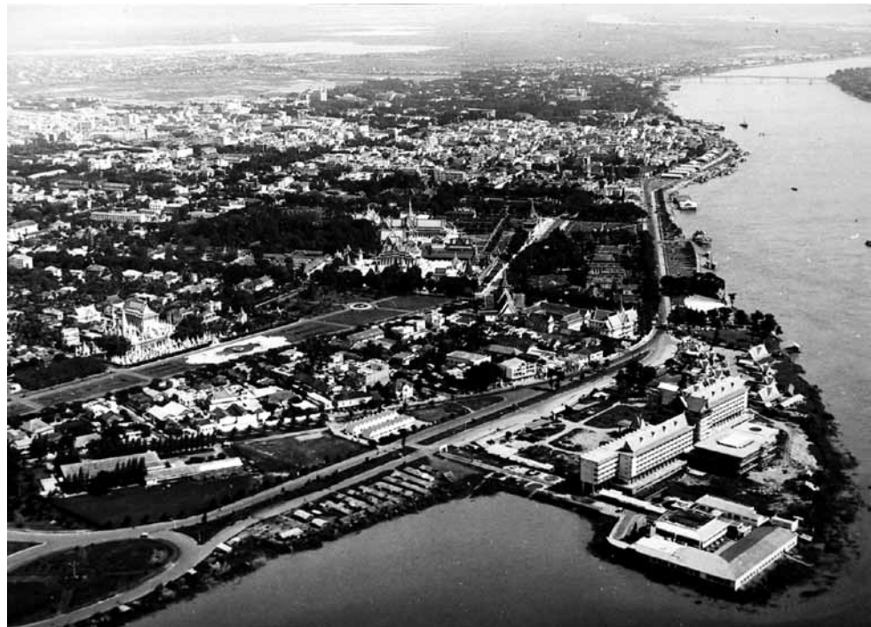
FIGURE 1. Historic aerial view of Phnom Penh at the intersection of Tonle Bassac and Tonle Sap. Source: H.G. Ross and D. Collins, Building Cambodia: New Khmer Architecture 1953–1970 (Bangkok: The Key Publisher, 2006), p.57. Photo by Vann Molyvann.

years ago, and the Seoul of forty years ago. Foreign investors today occupy key sectors of Cambodia’s economy, backing the most ambitious projects in development, banking, insurance, commodity manufacturing, and natural-resource extraction.