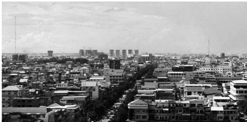
FIGURE 12. A view of the city with Mao Tse Toung Boulevard center.

Implicit in such practices are narratives of high returns, not only through the elite capture of land, but the promise of 100 percent profits and 60 percent rates of return. Such claims, subjective as they may be, soon become absorbed by the myths of rentier wealth, making it difficult to distill fact from fiction. Predictions of potential wealth are also validated by the presence of multinational firms, which drive up the price of property because they represent a sign of stability. Yet the metaphor driving Phnom Penh’s current growth is one that captures both the political economy of Asian urbanism and helps solicit consensus around the inevitability of growth that is both aspirational and inspirational. Cambodia’s economy and Phnom Penh’s urban growth are thus positioned within evolutionary and linear time, where development will unfold under the auspices of progress as the city of ruin is remade for the future.