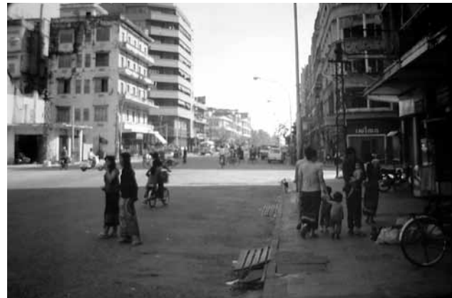
FIGURE 5. Phnom Penh circa 1986. Street unknown.

Postindependence urbanism in Cambodia was an explicitly modernist project that sought to articulate its legacy in built form. By contrast, the Khmer Rouge's project was temporal and Arcadian. But Khmer Rouge control of Cambodia from 1975 to 1979 left an equal, if not greater, legacy on Phnom Penh (FIG. 6). Representations of the latter period underscore the city's exit from history in 1975, and its reentry