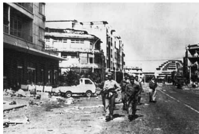
FIGURE 6. In January 1979 Vietnamese troops expel the Khmer Rouge from Phnom Penh. Psar Thmei is in the background. Source: Time Magazine, "The Rise and Fall of the Khmer Rouge." Photo by Bettmann/Corbis.