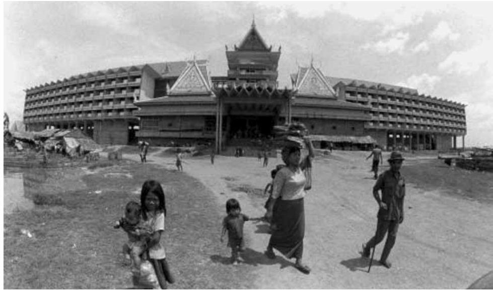
FIGURE 7. The city of refugees. These refugees are seeking shelter in the shell of the Cambodiana Hotel, part of the 1960s waterfront development undertaken by Sihanouk. Photo by Neal Ulevich, Associated Press, March 11, 1975.

radical collectivization, an estimated one million people died from starvation and internal purges. 87 This corresponded to a total 1970 population of only just more than 7 million. 88