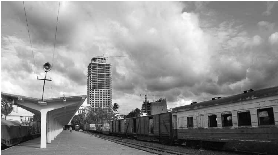
FIGURE 10. A train sits idle at Phnom Penh's railway station, built in 1932 during the city's colonial expansion. In the background is Canadia Bank's new headquarters.

Such forms of investment have been a distinctive feature of the Asian regional economy since the 1980s. 115 Of the $1.1 billion in foreign investment approved by the Cambodian government in 2007, $991 million came from within Asia (FIG. 10). This amounted to approximately 90 percent of total foreign investment that year. The principal countries of origin were Malaysia ($226 million), Thailand ($168 million), Vietnam ($138 million), China ($137 million), and South Korea ($86 million). The amounts pledged from each country may vary considerably from year to year; nevertheless, the top sources of foreign investment in Cambodia over the last decade have all been Asian. And even though the total figure for 2007 may be unimpressive in global terms, in relative terms, foreign investment in Cambodia increased five-fold from 2000 to 2007, from $185 million to $1.1 billion. The country's GDP growth shows why: it averaged a growth rate of 9.5 percent per year from 2000 to 2007, the fastest in Asia after China (its average 9.9 percent per year). 117